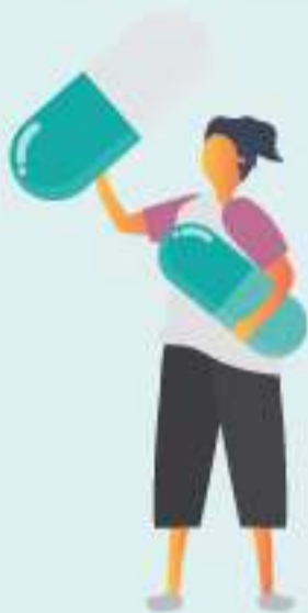
Statin Drug User