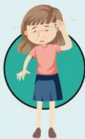
Lethargic and Fatigue