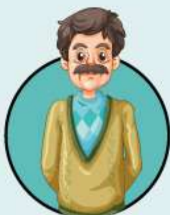
40 Years Old and Above